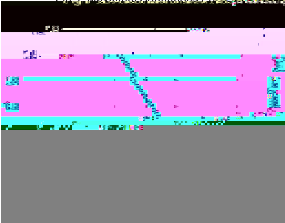
Fig. 1 Maximum Continuous Power Dissipation